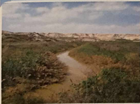
Lower Jordan River (2011)